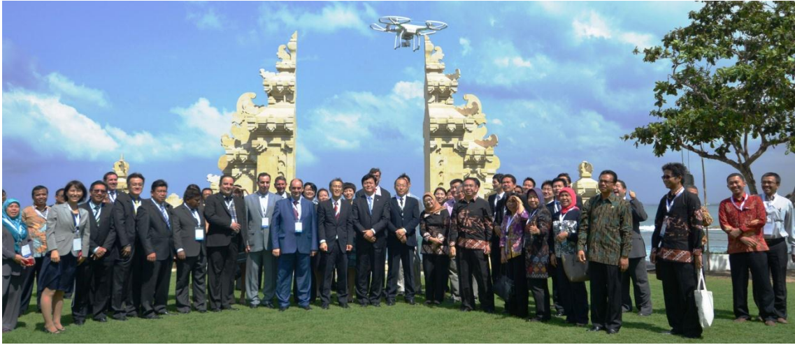
Group Photo with UAV