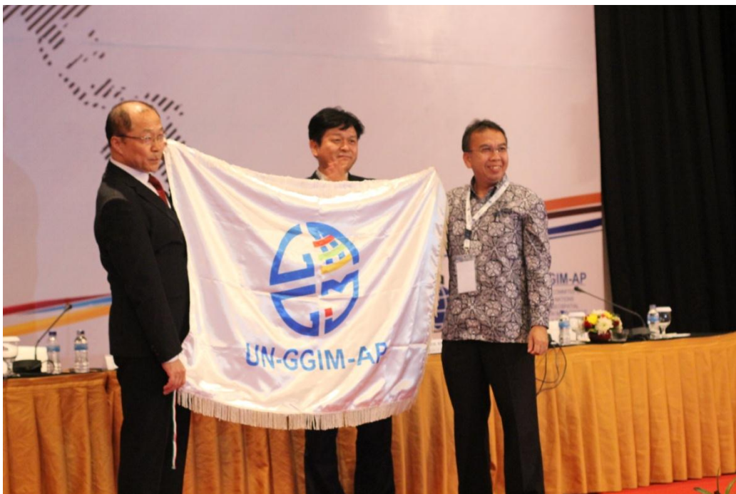
Flag hand-over ceremony from Indonesia to Republic of Korea